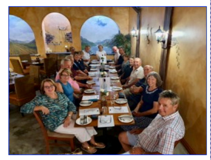
Lunch or dine at local cafes, pubs or restaurants.

If you are considering being a Venue Officer the first thing to think about is choosing a rally location that you feel comfortable in hosting, Look on the website for upcoming rallies and select a destination that you may have been to before or know something about. It is not vital as it can be fun researching the area in the months before the rally. A site visit is very helpful to check out the facilities first hand to report back to our members and to draw up a program for the rally. No point having a games night if there is no large covered area or the camp kitchen is too small to accommodate a casserole night.