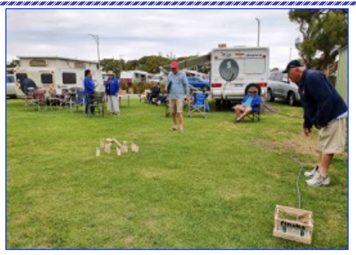
Finska requires more luck than skill.